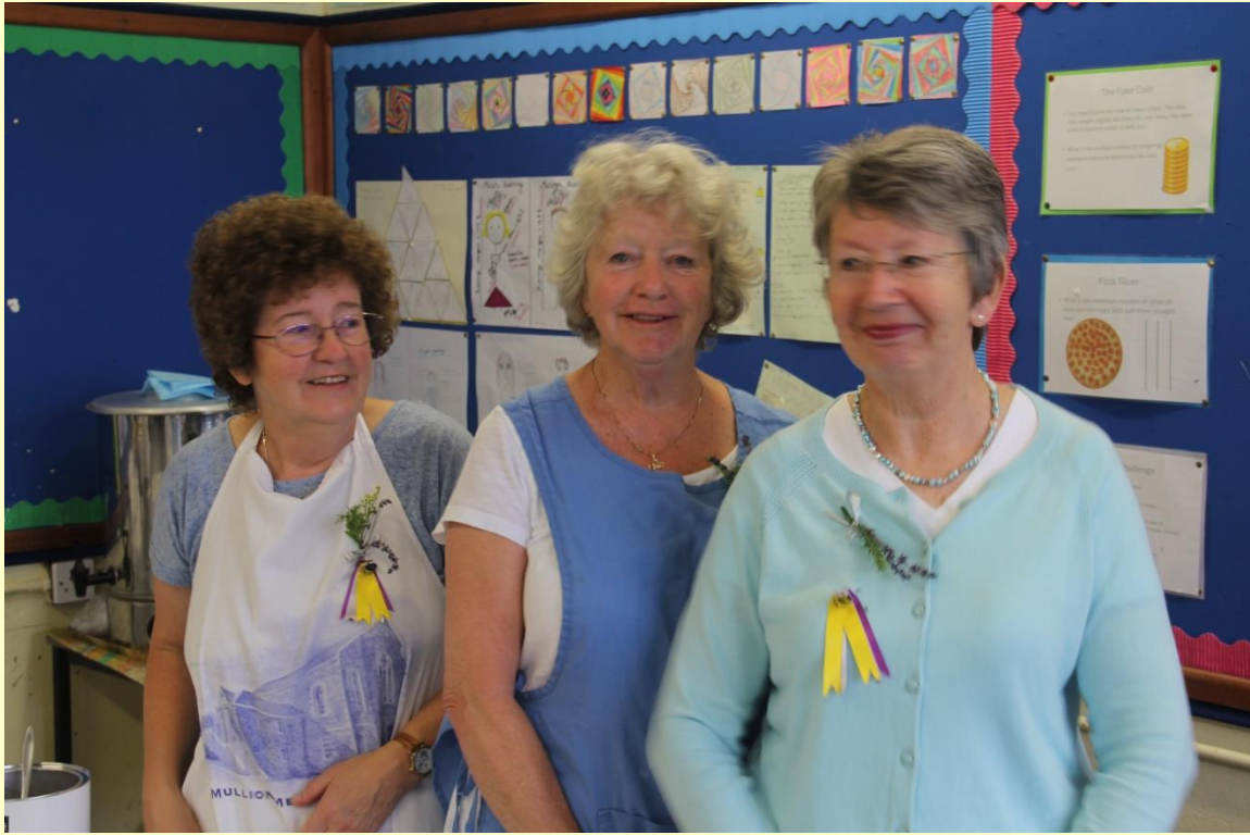
Well done to the tea, coffee, pasty, saffron bun ladies – and all with a smile