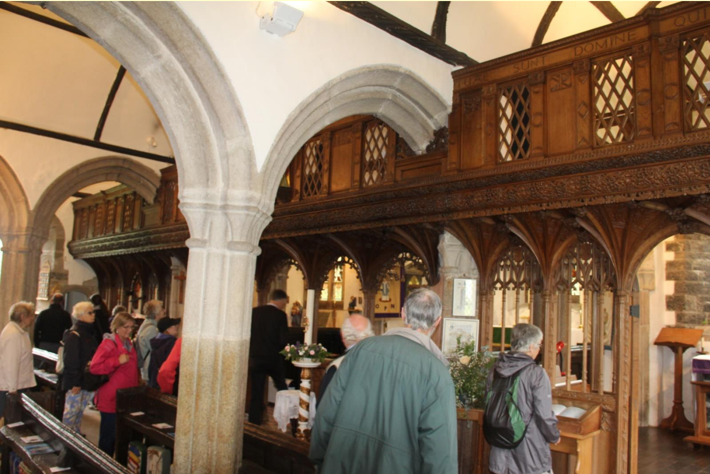
Mullion Parish Church – delightful, and what about those pew ends