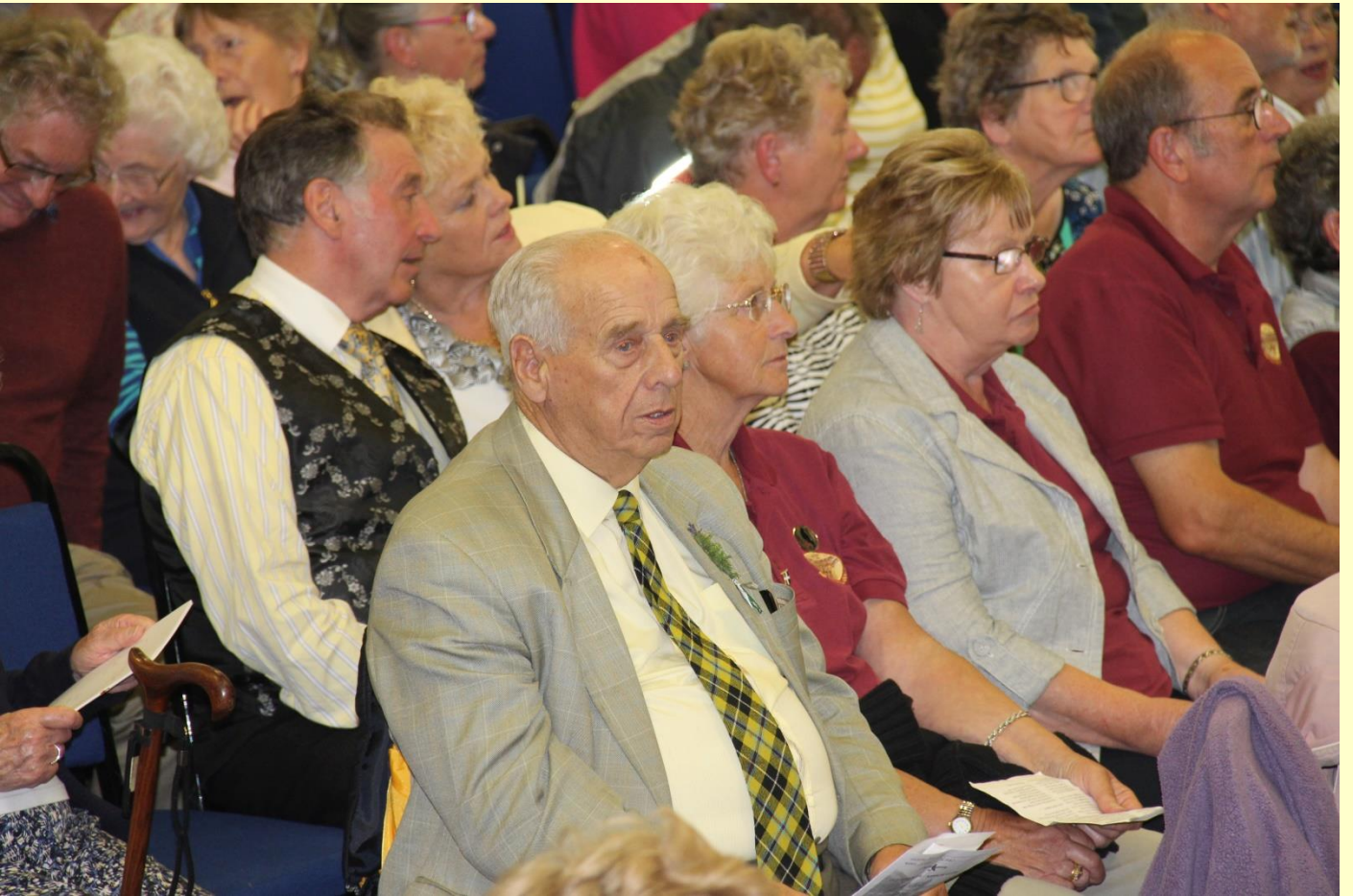
Quiet – for once!