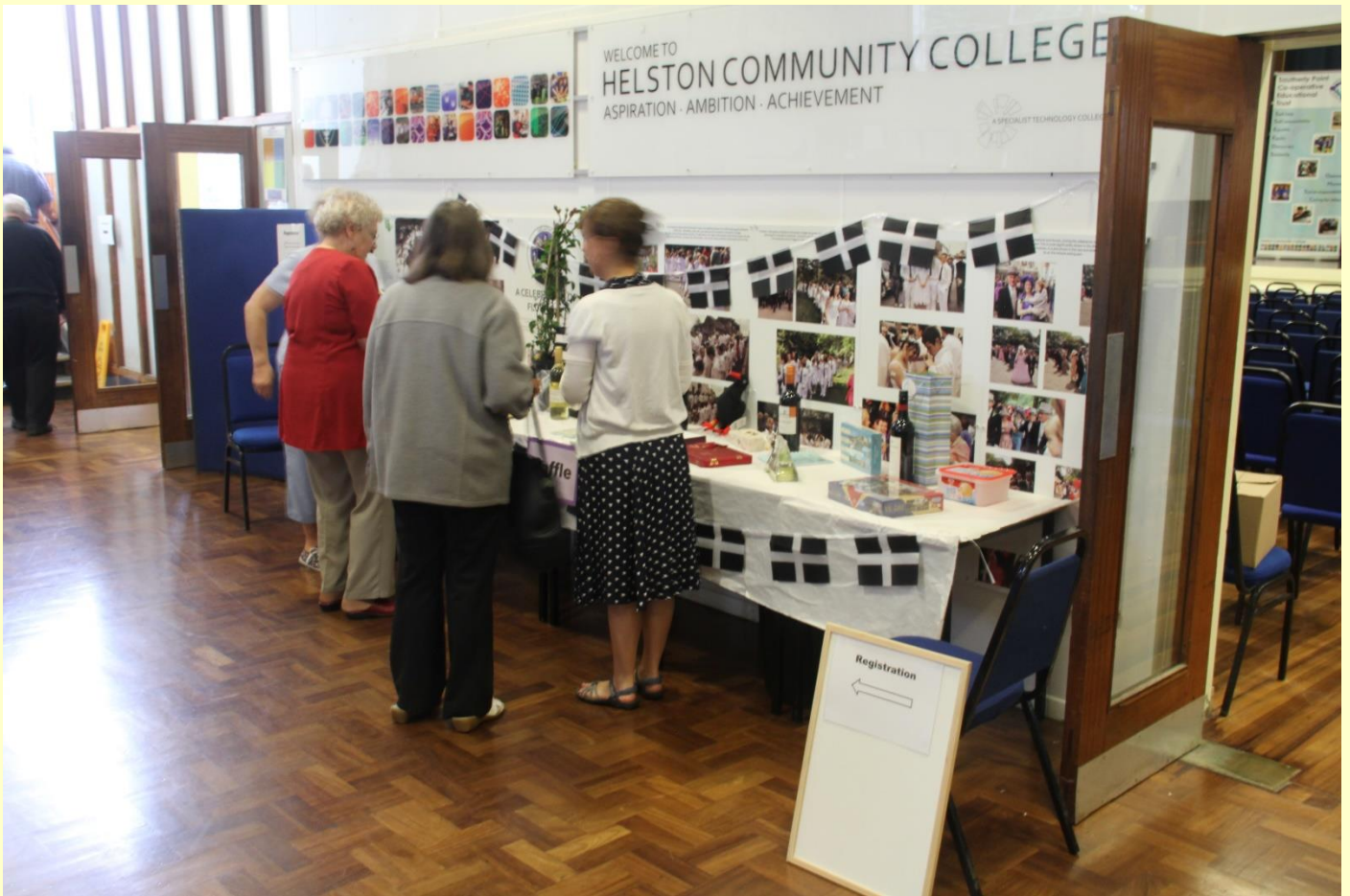
The raffle, an important part of balancing the books