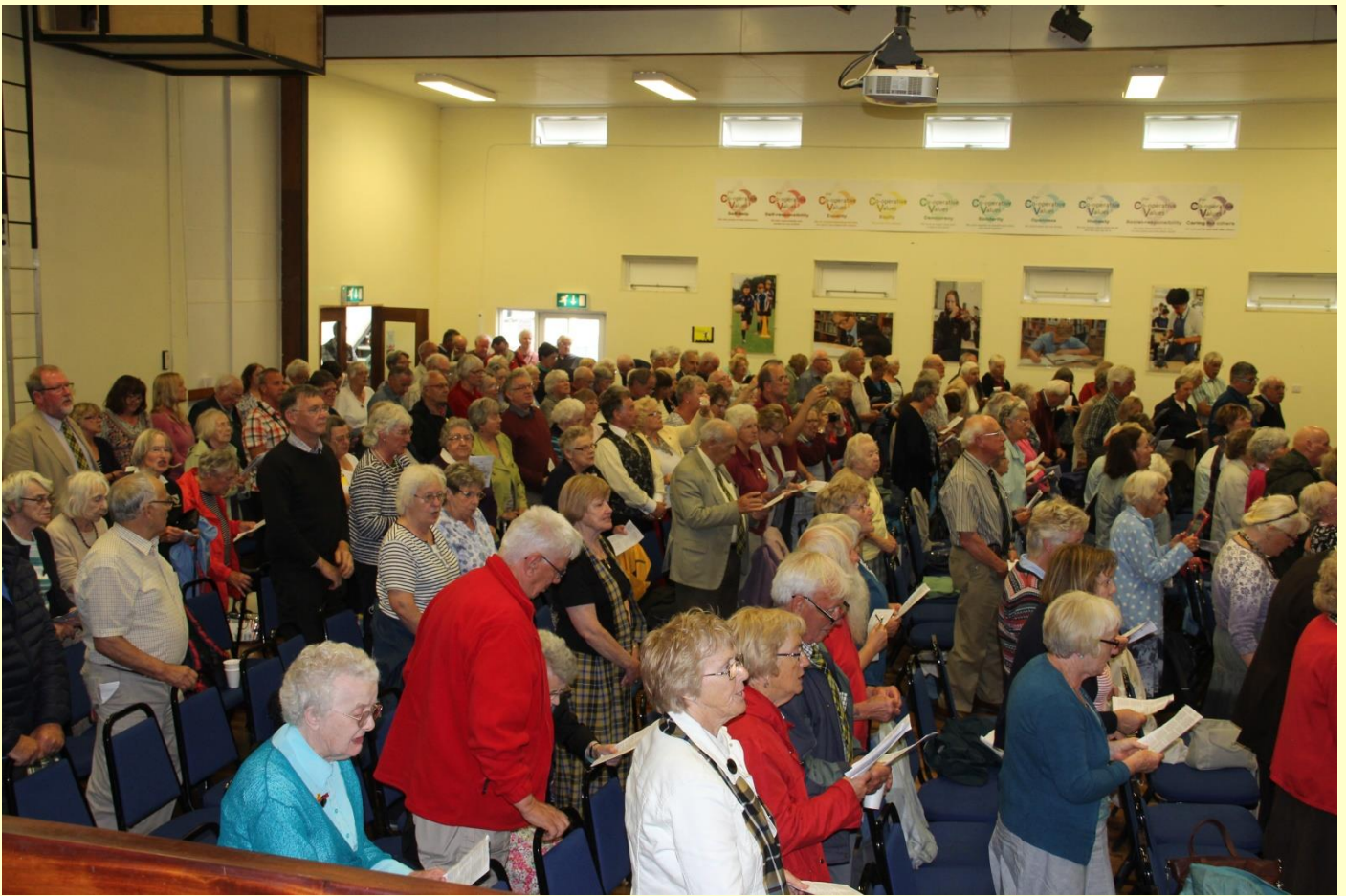
And to finish – what else, Trelawny: Cornwall's National Anthem