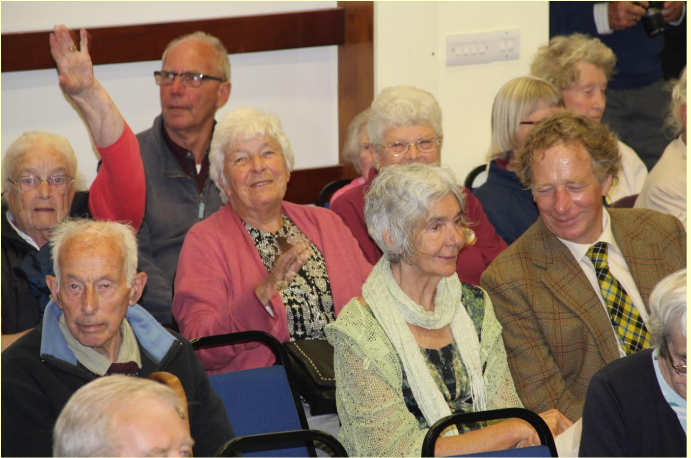
They from St Agnes are enjoying themselves