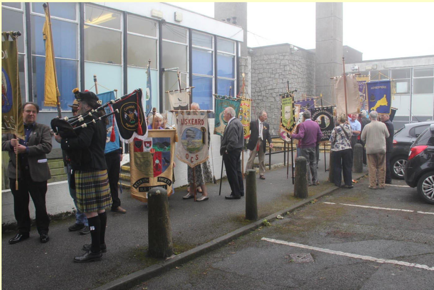
Almost ready for the off