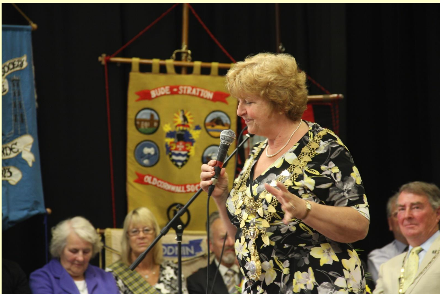
Councillor Gillian Greer – Mayor of Helston