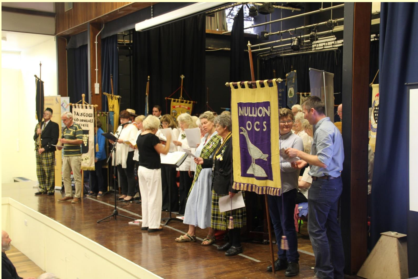
Hail to the Homeland led by the St Mellanus Singers