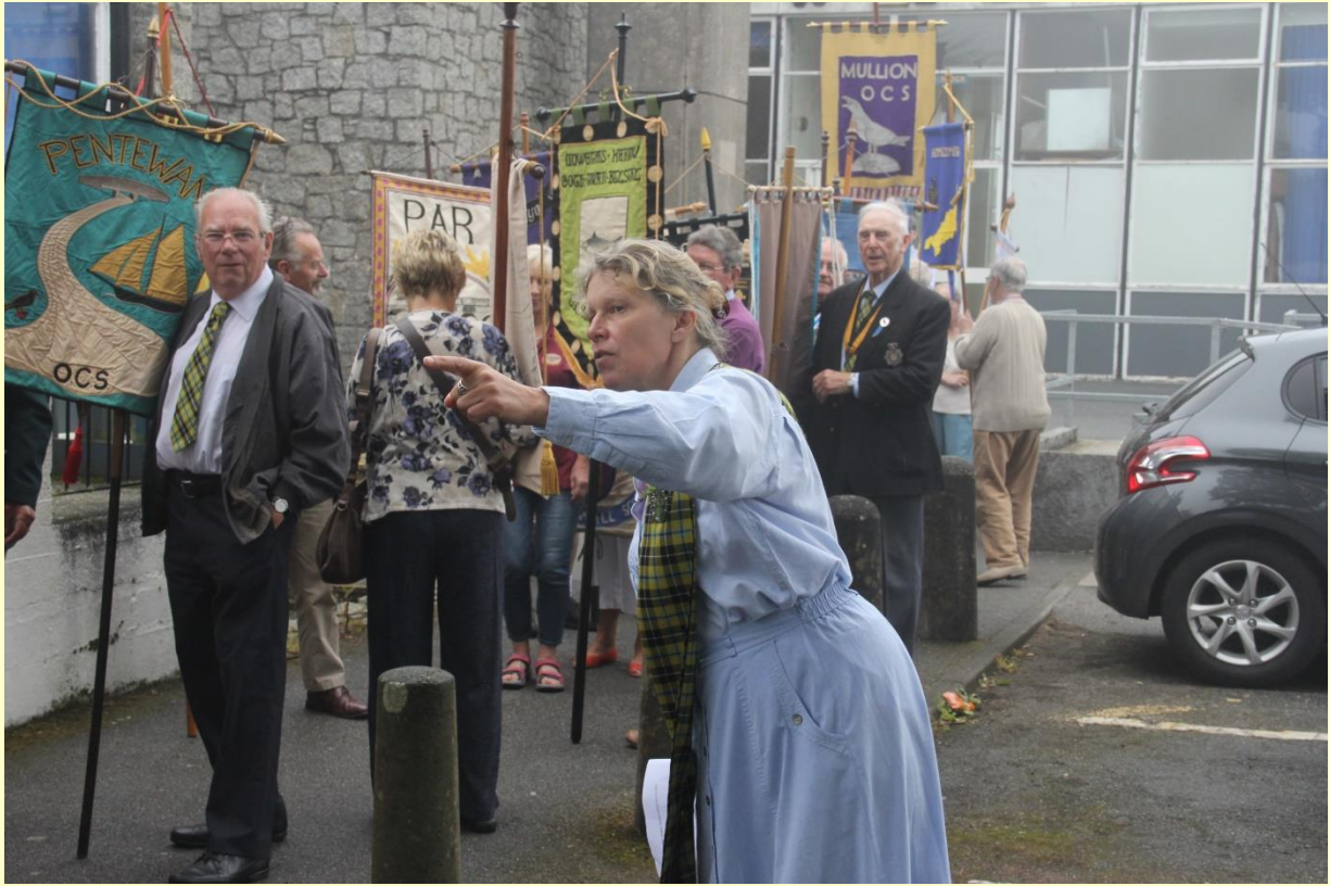
Yep, it's straight down there!