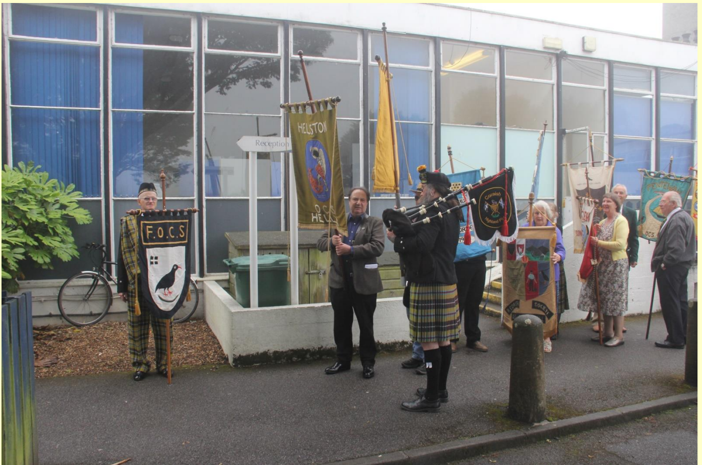
Getting tuned up