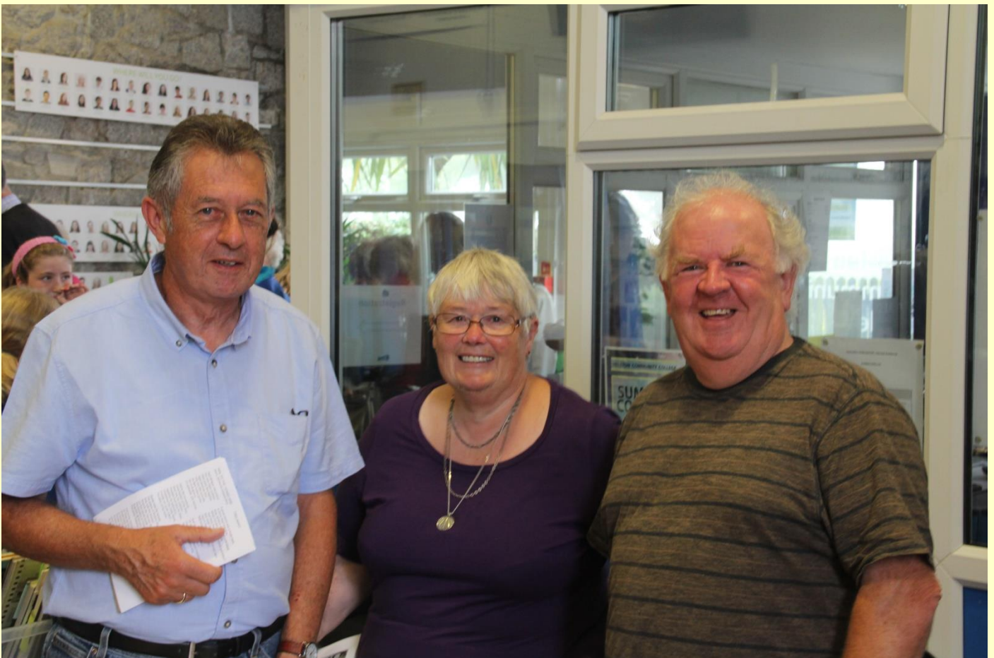
Pentewan meets St Agnes – and Redruth!