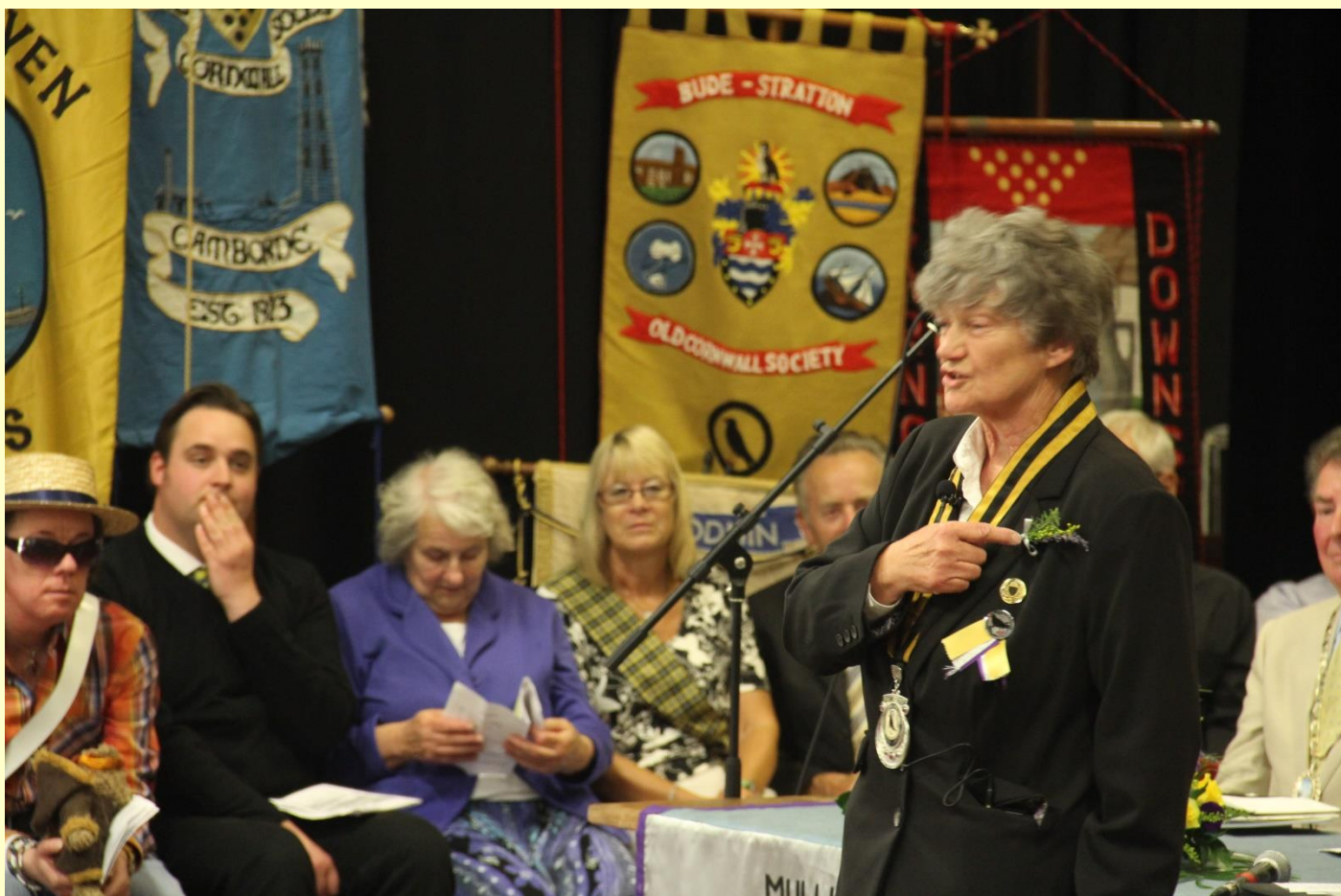
but I'm goin' this way!