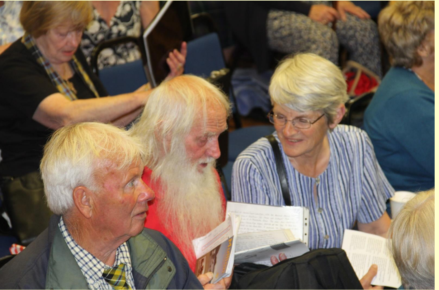
'Ang on, I got'n 'ere somewhere