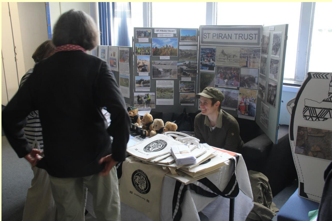
Some of the standings